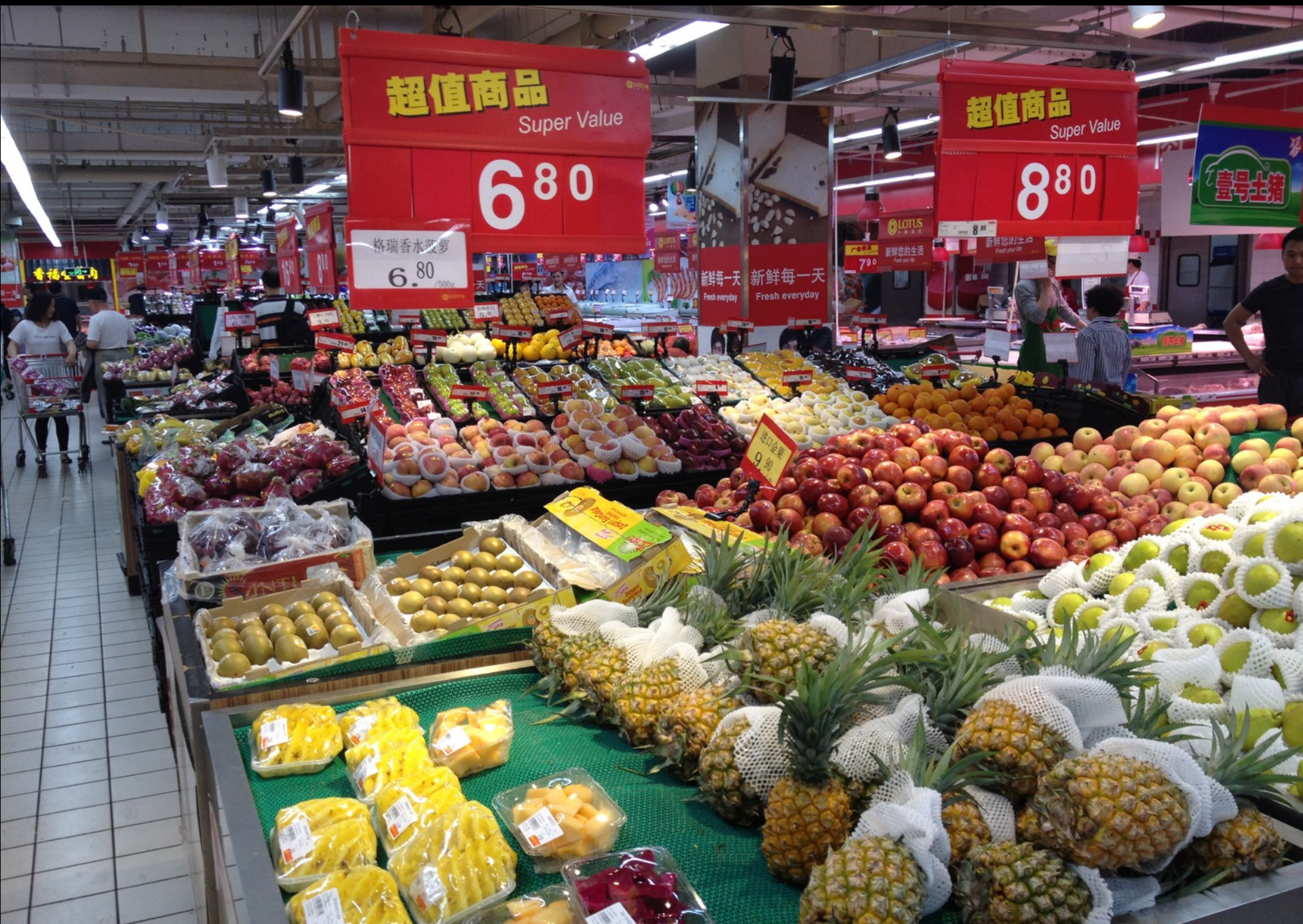
Lotus supermarket, Wodaokou, May 2, 2015